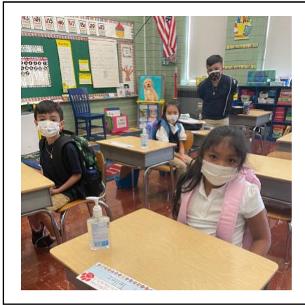
St. Frances of Rome students in their classroom and expressing thanks for the generous donations that help support tuition assistance.