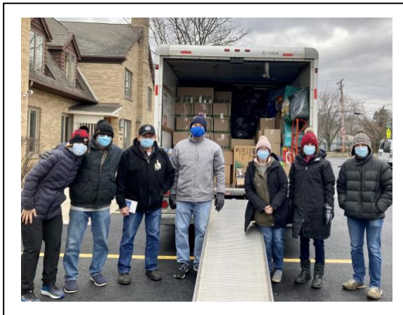
Sharing Board members and volunteers collect food and coats at the Fall Food Drive.

In addition, Sharing Board members distribute food at the pantry periodically.