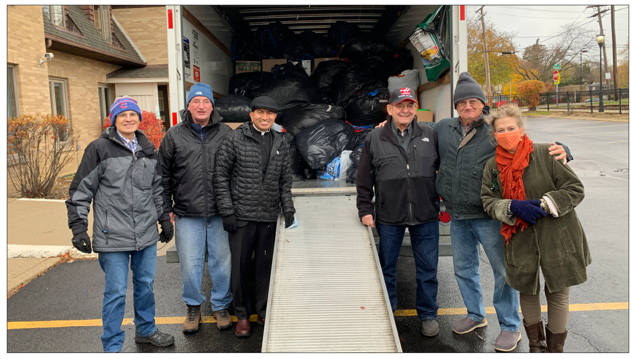
Sharing Board members and volunteers collect food and coats at the Fall Food Drive.

The generosity of Saint Anne parishioners is greatly appreciated by our sharing partners. Please continue to help those in need by supporting Parish Sharing through the Gold/Sharing envelopes or through electronic donations via Give Central.